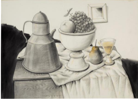
Fernando Botero (b. 1932) Still life Signed and dated 'Botero 98' (upper right) Charcoal and pastel on canvas 52 x 66 inches $300,000-400,000