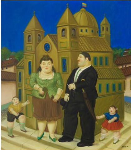
Fernando Botero (b. 1932) Frente a la catedral signed and dated 'Botero 94' lower right oil on canvas 44 x 38 5/8 in. (111.8 x 98.1 cm.) Painted in 1994 $700,000-1,000,000